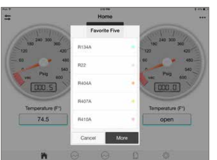
Access Favorite Five Refrigerants